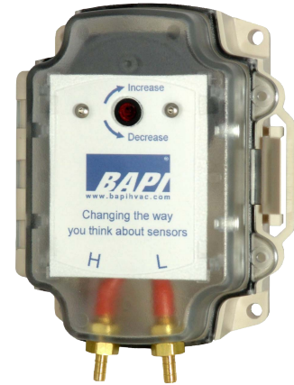
Differential Pressure Switch

The unit also features an extremely high proof pressure of 100" W.C. so that it will continue to function properly even if it is accidentally connected to an unusually high or low pressure.