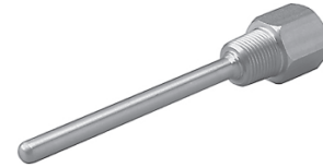
Two Part (welded) Thermowell*

Standard Thermowells available from BAPI include 304 stainless steel (machined), 316 stainless steel (machined), brass (machined), and two part* (welded) stainless steel. These wells are offered in 2", 4" and 8" lengths with 1/2" NPT external and 1/2" NPSM. Other lengths and thread diameters are available upon request.